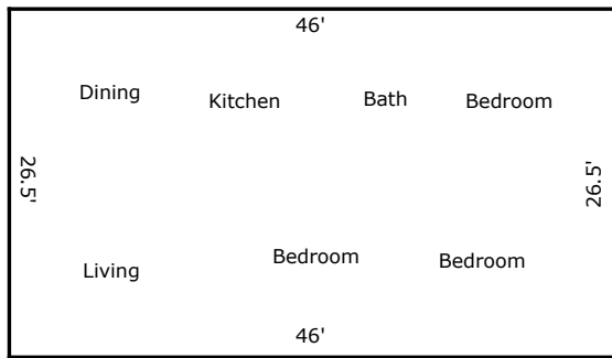
First Floor [1219 Sq ft]